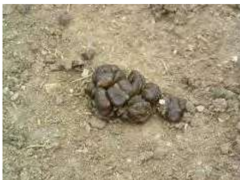
Figure 1-2 - Faecal consistency score 2 – thick manure