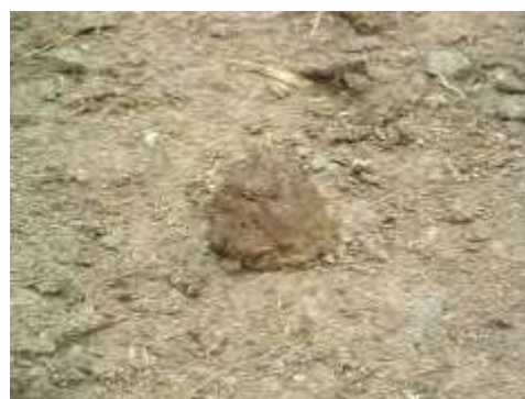
Figure 1-4 - Faecal consistency score 4 - runny manure; forms a loose pile