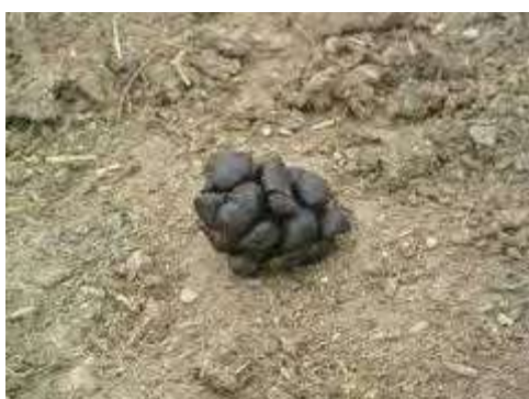
Figure 1-1 – Faecal consistency score 1 – hard pellets

Faecal consistency can be estimated on a scale of 1 to 5, where hard pellets would be considered 1, and fluid faeces are a 5. Monitoring faecal consistency is an important tool in identifying and managing acidosis and other health and nutritional disorders.