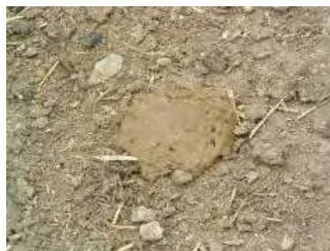
Figure 1-5 - Faecal consistency score 5 - very liquid manure; includes diarrhoea