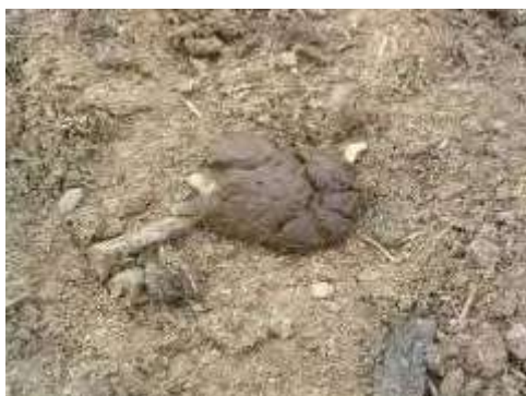
Figure 1-3 - Faecal consistency score 3 - porridge-like consistency; forms a soft pile